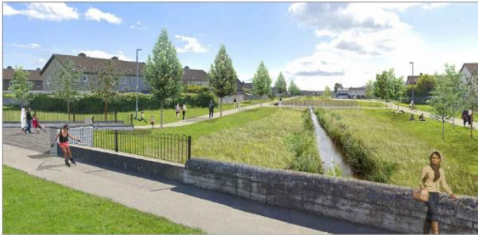
View into park from Jobalun Road as proposed