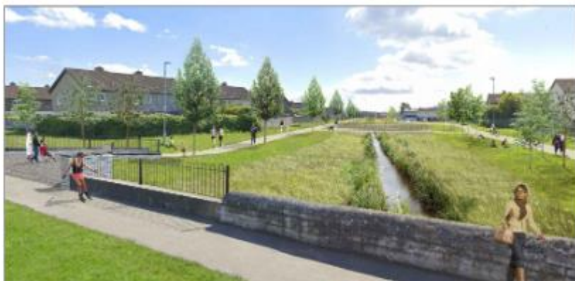
View from park from Jobstown Road as proposed

The Whitestown stream has been on OS maps as far back as the 1830s. So these bridges should show that heritage and history clearly in the new / upgraded bridge designs.