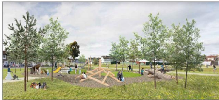
View of children's play area at end of Cloonmore Road as proposed